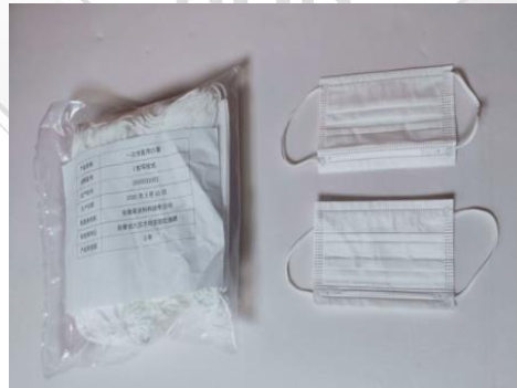
Photo of Samples

Note: Pass = Meet customer requirements; Fail = Fail customer requirements; # = No comment; N.D. = Not detected.